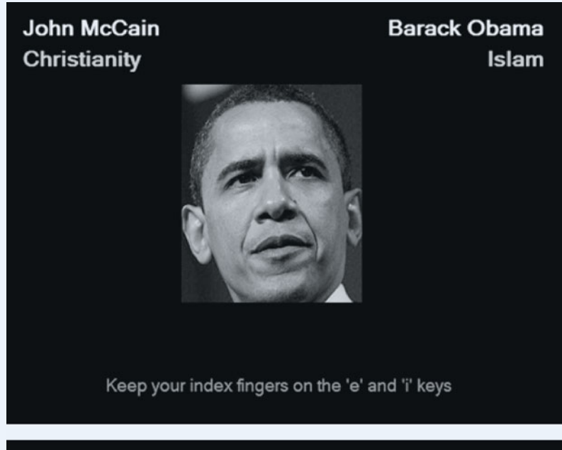
Figure 1 Screenshots from the Candidate-Religion Implicit Association Test (IAT)

We begin by briefly reviewing some descriptive statistics from our survey and Candidate-Religion IAT (see table 1). First, only a slight majority of respondents (57%) were able to correctly identify Obama as a Christian, whereas a sizeable portion of the sample (41%) stated that it is "very likely" or "somewhat likely" that Obama is a Muslim. Moreover, we find that there is an overall IAT effect, M_{D\text{-score}} = 0.21 , such that subjects automatically associated Obama with Islam. To put this in perspective, a mean